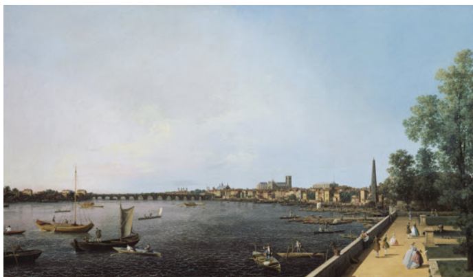
The Thames from Somerset House Terrace towards Westminster

styles from Baroque to Turkish and Gothic Revival. In Warwickshire Francis Greville made improvements to Warwick Castle (painted five times by Canaletto), employing the architect Daniel Garrett and the landscape designer Lancelot