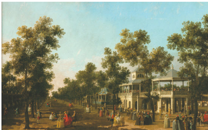
The Grand Walk, Vauxhall Gardens

“Capability” Brown, who would later contribute to the grounds at Compton Verney. Canaletto, who had come to England in search of new sources of income and new subjects, recorded both the buildings that were about to be demolished and the new ones that were replacing them, sometimes editing out the scaffolding. As the son of a set designer he was adept at composing views enlivened by colourful foreground figures and cleverly lit to draw attention to the intended focus of the background. He influenced many British painters from Samuel Scott and William Marlow who portrayed London as the new Venice, through to Turner. This exhibition brings together magnificent paintings and drawings from the