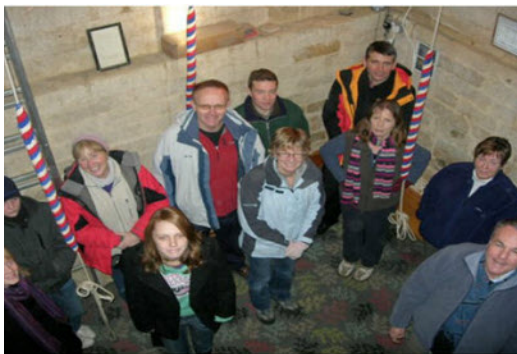
Some of the ringers at St. Peter's Kington