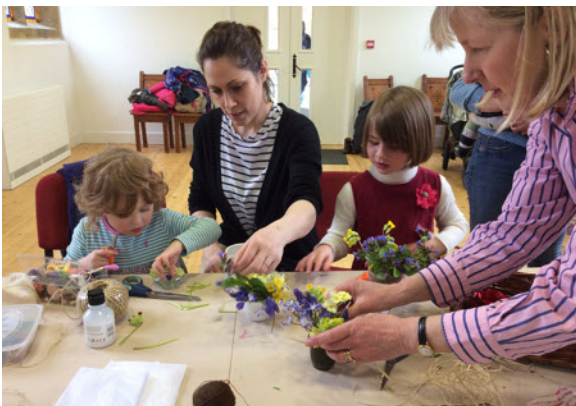
Making an Easter garden.