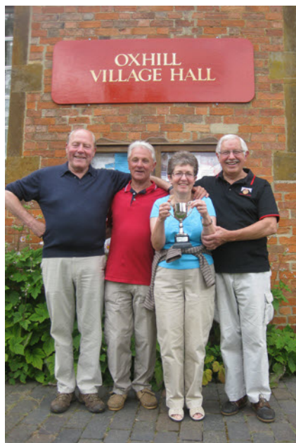
Boules Champions (and runner ups) 2011

The event kicks off at 12.30 pm and tickets, which can be obtained from Tricia Harbour on 680676, are £8 per person & Children (up to age of 12) are free. This cost covers the food & entry to the competition.