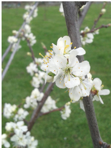
Blossoms from Greengage Deniston's Superb

Just before Easter we had a wonderful visit from years 2 and 4 at Tysoe School. Some of the children had visited last summer so they knew, and remembered, a lot about the orchard! It was such a pleasure to see them running around having a great time looking for various